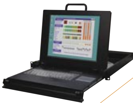
Individual for LCD display and keyboard module