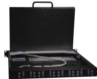
No special cables required, up to 8 computers connection!